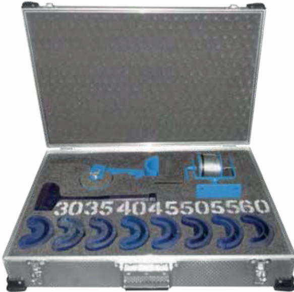
SERVING TOOL KIT

THE SALVA-VIDA SERVING TOOL KIT, MANUFACTURED IN RSA FOR RIGGER ROPESMEN THAT REQUIRE A ROBUST MULTI-PURPOSE TOOL FOR SERVING STEEL WIRE ROPE ON SITE.